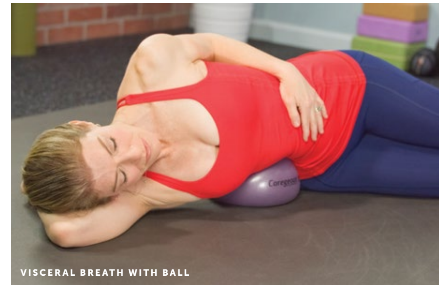
VISCERAL BREATH WITH BALL